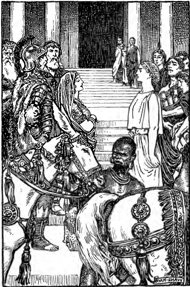
PELAGIA AND HYPATIA